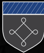
CARLETON HIGH SCHOOL

Each academy has its own website, please visit these websites to find out more about the academy where you will be working.